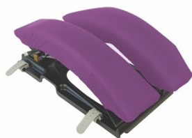
KYRA9000 Curve Spine Frame

KYRA9000K – KYRA Curve Spine Frame System includes: