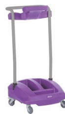
KYRA1100 Curve Spine Frame Cart